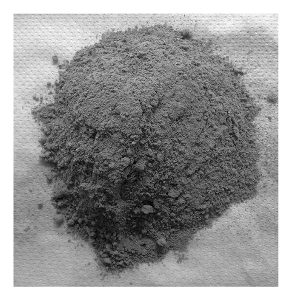
Fig. 1. The ash used to research

Density of ash as determined by helium pycnometry was 2.65 g/cm<sup>3</sup>. The results of the study of the chemical composition is shown in Table 1. The main components of tested ash SiO<sub>2</sub>, P_2O_5 , K_2O and CaO.